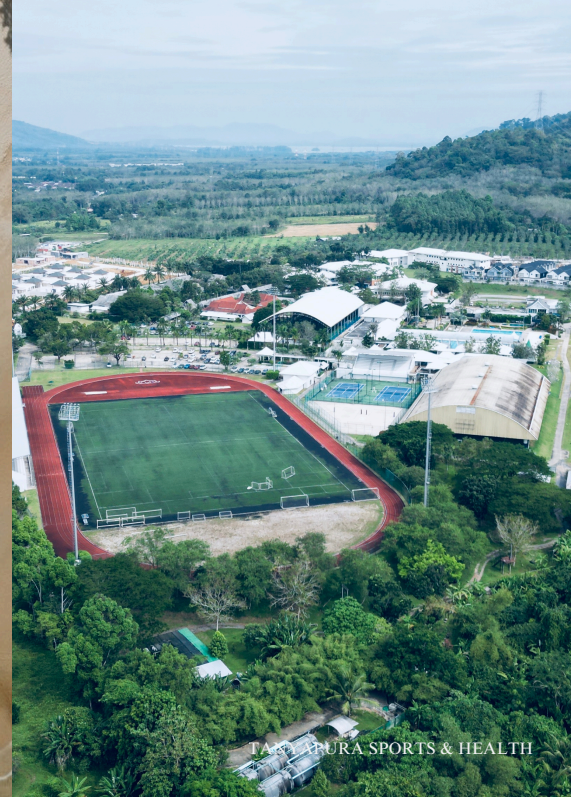
TANJUNGPURA SPORTS & HEALTH