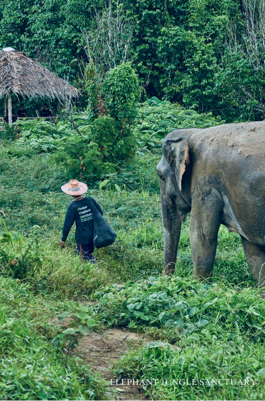
ELEPHANT JUNGLE SANCTUARY