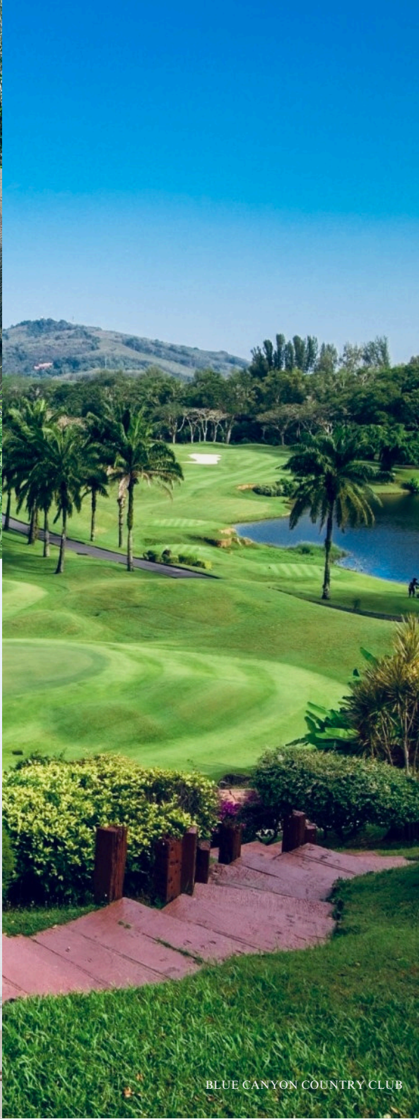
BLUE CANYON COUNTRY CLUB