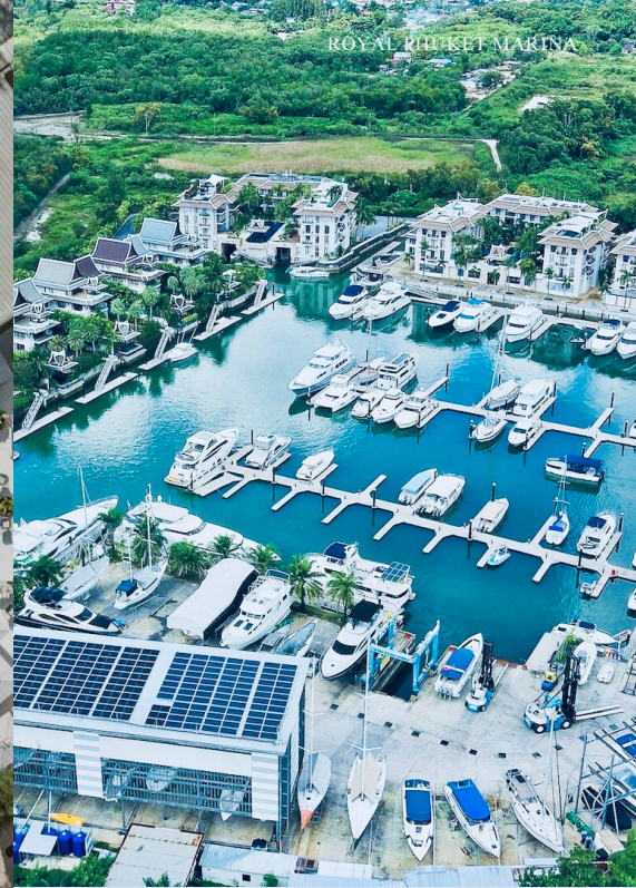
ROYAL RHUKET MARINA