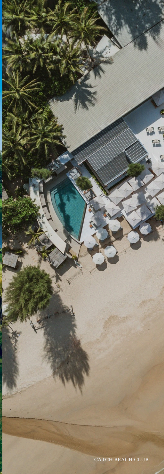
CATCH BEACH CLUB